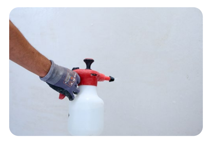
• Lightly dampen the surface.